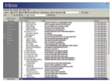
Spam – a growing problem

Spam (unsolicited e-mail) is a global epidemic. A recent Gartner Group survey revealed that 34% of business e-mail is useless. The same study also revealed that employees spend, on average, 49 minutes per day managing e-mail. The European Commission also reports that Internet subscribers worldwide are unwittingly paying an estimated US$9.4 million a year in connection costs – just to receive junk e-mail. So how do companies tackle this escalating problem? The solution is clear. Tackle the problem at source with SkyScan Anti-Spam (AS).