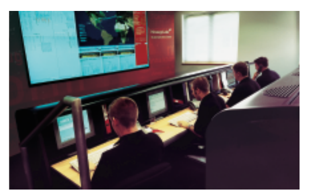
Global Operations Centre (GOC)

Sign up for the SkyScan AS service and you'll receive unprecedented levels of technical and customer support through the MessageLabs Global Operations Centre (GOC). Based in the UK, the GOC supports customers worldwide 24x7x 365, has multi-lingual abilities and is backed up by local operations in key locations. Additionally, our support technicians monitor the network and the e-mail passing through the system to ensure the SkyScan service is continually updated. So you don't have to worry about a thing.